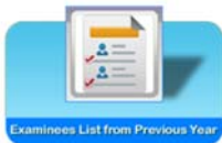
Examinee List from Previous Year

Many balaks and balikas have taken the Bal Satsang Exams last year. You do not need to create new profiles for these examinees again as they are already in the system. In order to register these examinees you must click the Examinee List from Previous Year button on your Dashboard. However if they are over 14 yrs. their names won't appear in the list.